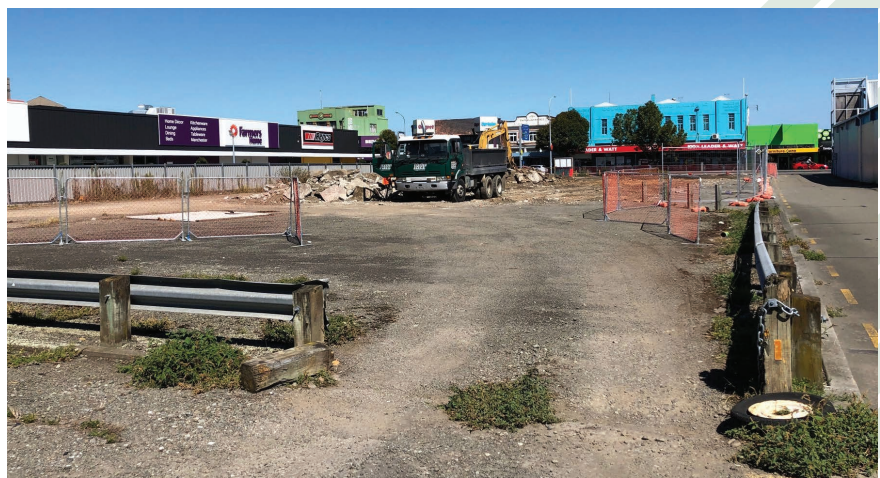
152-166 Rangitikei Street development

Plans are well underway to build nine double bedroom units on the existing site at Baxters Limited. It is anticipated that these units will continue to be rented by students at Massey and more specifically their whānau who will be with them as they complete postgraduate study.