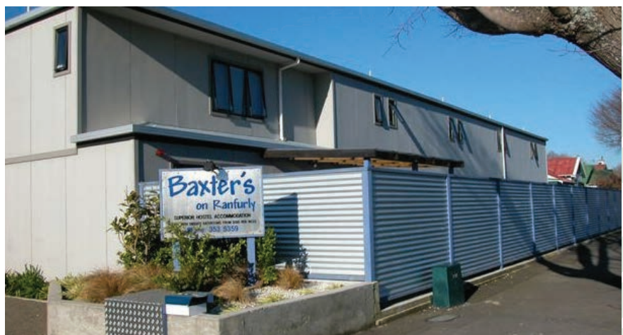
Baxters on Ranfurly Street development