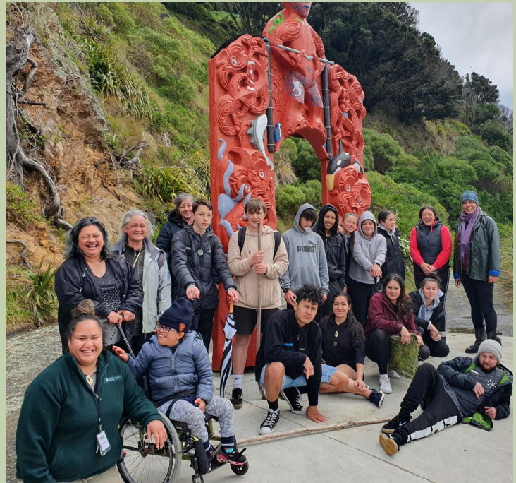
Rangatahi, Trustees, and Department of Conservation staff in front of the pou on Matiu Island