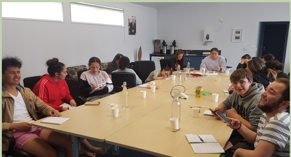
Future leaders testing out the boardroom table at Hīkoikoi