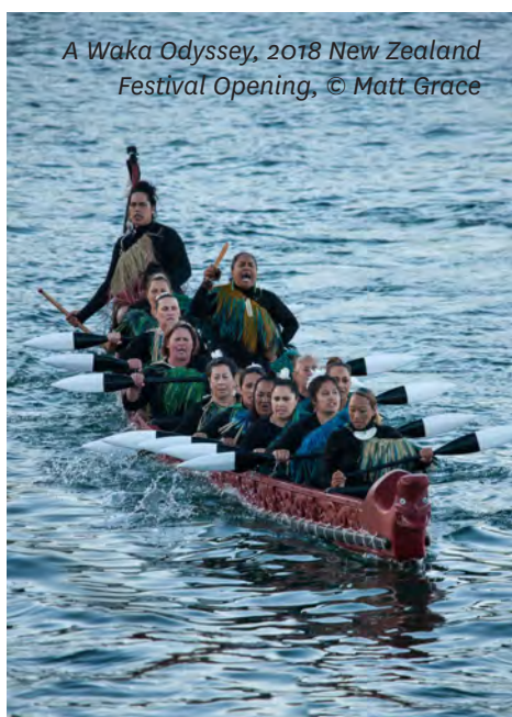
A Waka Odyssey, 2018 New Zealand Festival Opening, © Matt Grace

Estimates of 25,000 people attended the event to witness four waka hourua (voyaging waka) from NZ and Samoa, four waka taua and waka tete from Te Raukura (Te Wharewaka) and Waiwhetu, and waka ama, come in to Te Whanganui-a-Tara for a choreographed