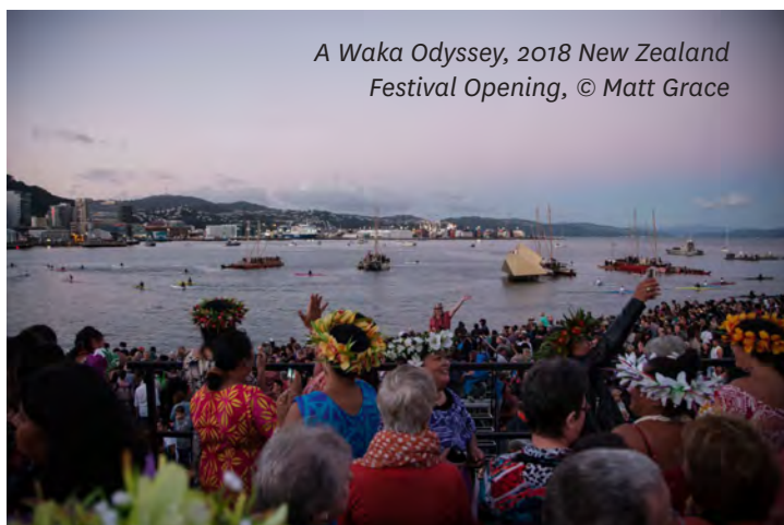
A Waka Odyssey, 2018 New Zealand Festival Opening

The call by the kaikaranga from the waters' edge set the tone for the kohatu ceremony that followed. The weather was fantastic and crowds of people were able to board the waka hourua to meet the navigators and their crew and find out more about star navigation. Later there was the opportunity to enjoy music, cultural performances, and of course kai stalls that were set up on the adjoining park.