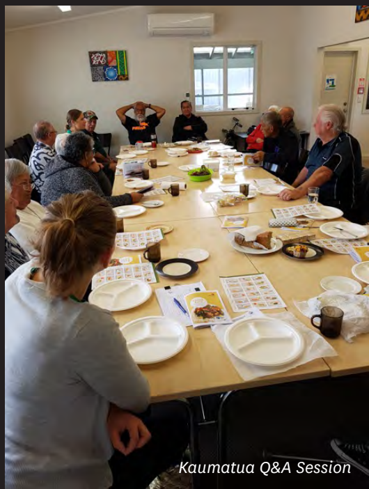
Kaumātua Q&A Session

Every Monday kaumātua have their regular hui at Hīkoikoi. From 9 April kaumātua alongside other whanau have been participating in the Te Awakairangi Health Network Good Food programme – E kore e mutu tēnei mea ko te ako which focuses on nutrition and cooking on a budget. Around 18 of our whanau came to the first session and each session of the 5 weeks programme typically runs for 2 hours and has an